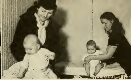
City settlements serve all ages—meetings for grandmother; medical care for baby